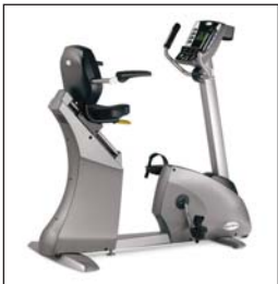
Matrix H5X Hybrid Cycle

Restoration and Rehabilitation Center to Galeon Retirement Community in Osakis, Minnesota. Age Dynamics worked with architects on both projects to guide space allocation and layout. The firm also made equipment recommendations. For assistance with wellness programming or the design of a new wellness facility, contact Age Dynamics at 800-929-2719, or go to www.agedynamics.com .