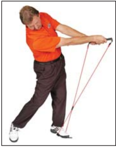
GolfGym PowerSwing Trainer