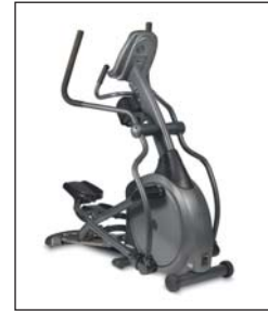
A new elliptical trainer from Vision Fitness

Technogym's Excite cardiovascular equipment now includes Active Wellness TV. This new feature integrates technology, motivation and equipment functionality for a nonintimidating and enjoyable cardiovascular experience. The TV, an easy-to-use touch screen LCD, adapts to workout preferences based on user types and quickly orients users to the desired workout and entertainment selection. Active Wellness TV integrates with iPods, and users can play videos, select play lists and control volume through the touch screen. This feature is also compatible with other entertainment devices, including the MS ZUNE and Creative Zen. For more details, call 800-804-0952, ext. 320, or visit www.technogymusa.com .