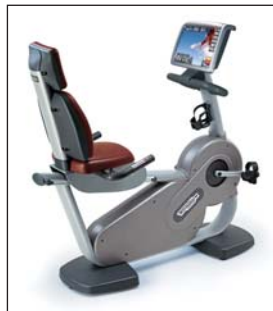
Technogym's Active Wellness TV

weighted, these dumbbell-style tubes are six-to-nine inches in length and conform to hands, providing a suitable grip for upper-body resistance rehabilitation and walking activities. Comfortably secure, stretch-elastic hand straps eliminate overgripping and hand fatigue. In addition, the wider grip and ergonomic design of these weights assists those with weak wrists, hands and forearms. Available in one to five pounds, SPRI's Mini Contour-Weights may also be used for added lower-body resistance while performing exercises such as squats and lunges. Visit www.spriproducts.com or call 800-222-7774 for more information.