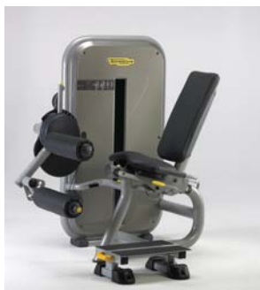
Inclusive Line leg curl machine, from Technogym