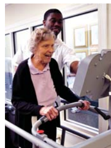
A client uses the Biodex Gait Trainer

teerism, offering informal help to others, and giving/receiving social support. See www.mymasterpieceliving.com for information about Masterpiece Living.