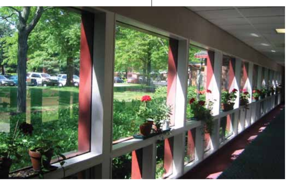
The architecture at Meadow Lakes was designed to bring nature in. Pleasant outdoor views help to draw people out. (The geraniums on the sills are propagated and raised by resident volunteers.)