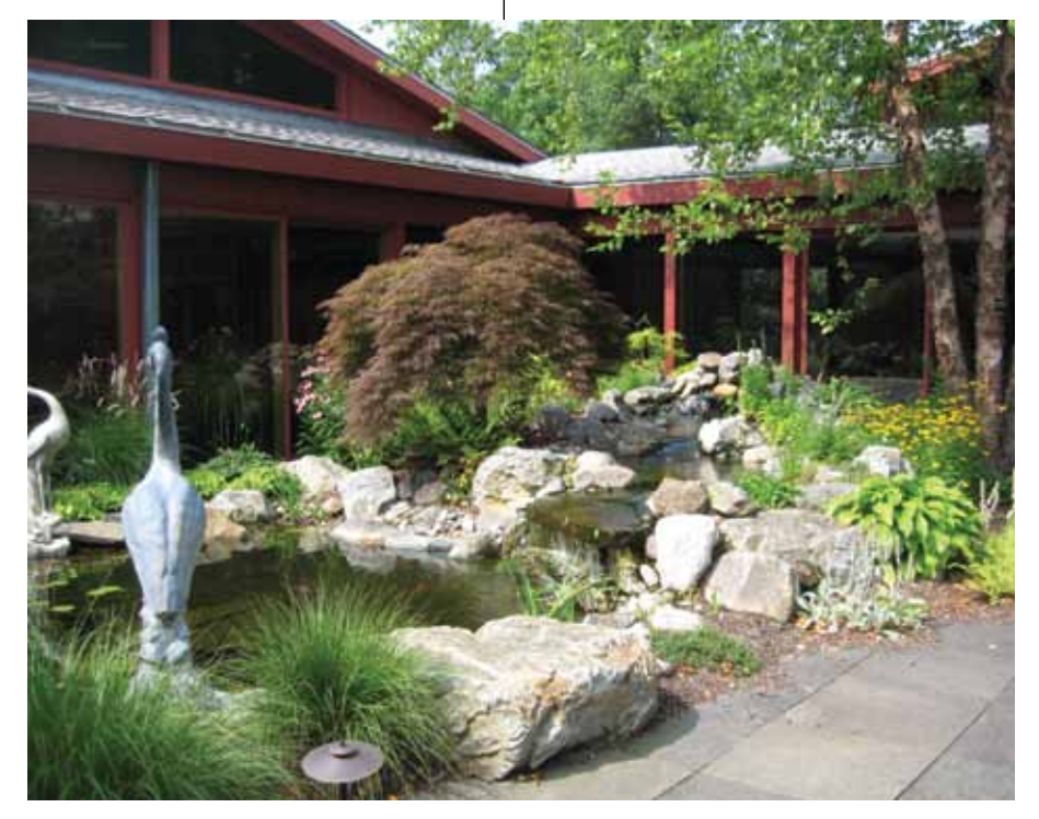
Sounds of running water, a lovely view and plenty of windows help to encourage Meadow Lakes' residents to go outside.

Residential communities that have choices in outdoor features, such as a swimming pool, walkways, gardens and courtyards, also have more active residents, according to a report from the Active Living by Design group. Covered walkways between buildings and highly visible outdoor areas also increase activity levels.<sup>22</sup>